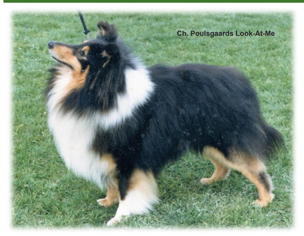
sired 12 champions, including 8 from kennel "Poulsgaard".